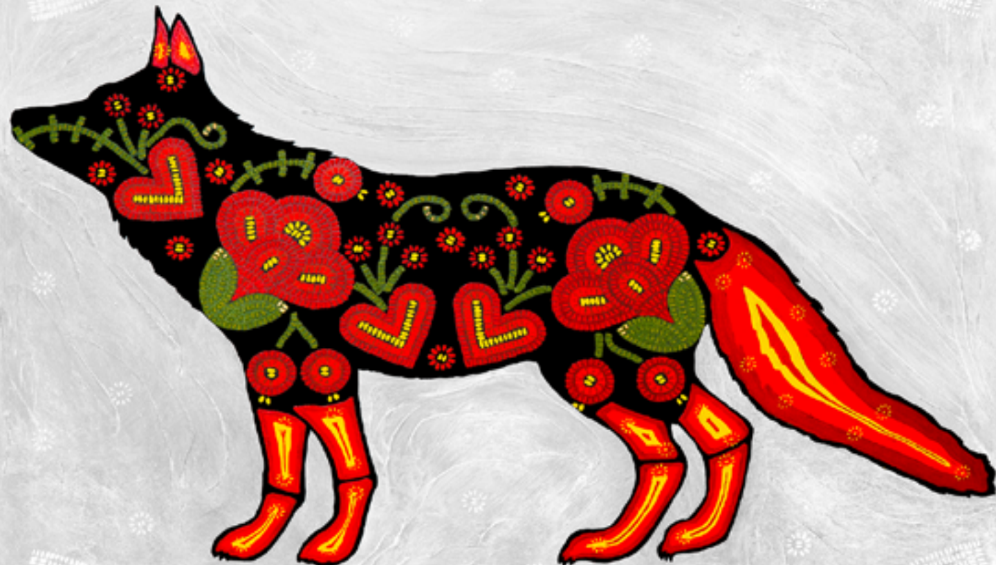
Observant and Unassuming

The CWHC actively engages in ongoing efforts to provide information to stakeholders ranging from funding Federal, Provincial, and Territorial government agencies to the wildlife health expert community at large. We also provide a wealth of important information to the public at large, including fact sheets, blog articles and social media posts, to educate and inform Canadians about what signals we are observing in the environment.