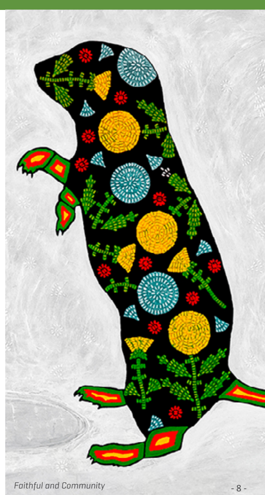
Faithful and Community